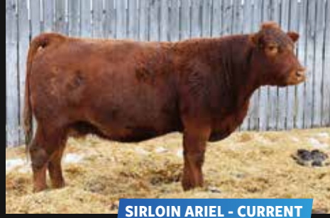
SIRLOIN ARIEL - CURRENT DAM OF LAWLESS